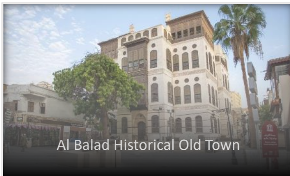
Al Balad Historical Old Town