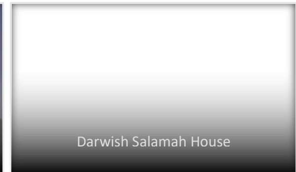
Darwish Salamah House